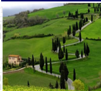
OOTY TEA GARDEN